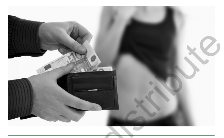
▲ Image 1.2 Prostitution is considered a mala prohibita offense because it is not inherently evil and is even legal in many jurisdictions around the world.

Other crimes are known as acts of mala prohibita , which has the literal meaning of evil because prohibited . This term acknowledges that these crimes are not inherently evil acts; they are bad only because the law says so.<sup>6</sup> A good example is prostitution, which is illegal in most of the United States but is quite legal and even licensed in most counties of Nevada. The same can be said about gambling and drug possession or use. These are just examples