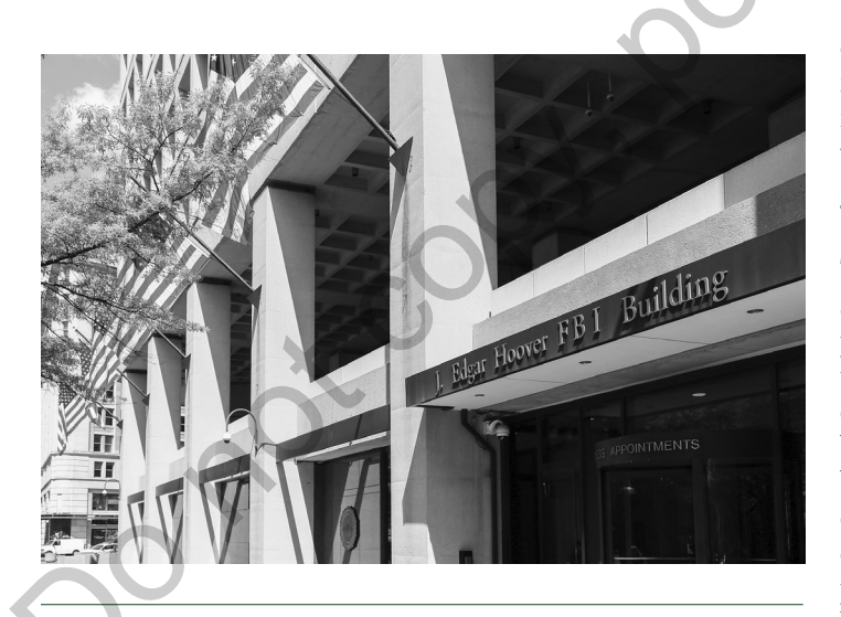
▲ Image 1.4 The annual UCRs are produced by the FBI. Local, county, and state criminal justice agencies send their annual crime data to the J. Edgar Hoover Building in Washington, DC. UCR data are, by their nature, incomplete, as many crimes are never reported to the police at all. This dark figure of crime might be as high as 90% of all crime incidents.

The third measure, which is perhaps the most important for purposes of this book, is self-report data (SRD), which are primarily collected by independent academic scientists or think tank agencies, such as the RAND Corporation. Participating in surveys or interviews, individuals report crimes against themselves or crimes they have committed. This measure is the most important for the purposes of this book because the UCR and NCVS do not provide in-depth information on the offenders or the victims, such as personality, biology or physiology, family life, and economic information. These factors are of the utmost importance for our purposes because there is a broad consensus that they cause people to commit crime, yet they are missing from the most commonly used measures of crime. SRD are the best, and in most cases the only, measure for figuring out why some people offend and others do not. However, like the other measures, self-reports have numerous weaknesses as well as strengths.