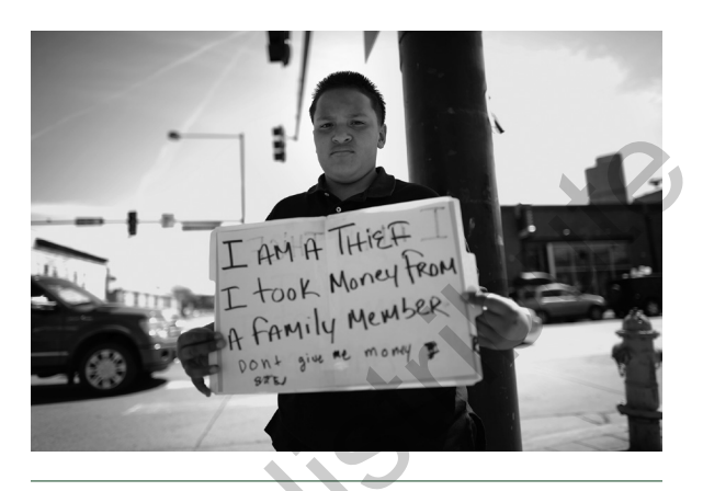
▲ Image 1.6 Offenders being forced to hold signs as part of their punishment is becoming a more popular informal sanction that shames individuals in their communities.

Another major group that experiences an extremely high rate of victimization, particularly for homicide, is Blacks. (The term Black is used here, as