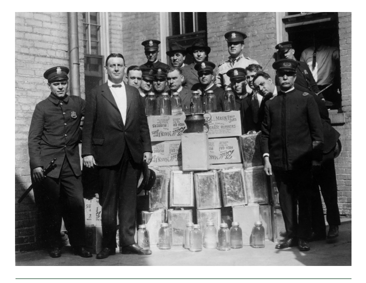
▲ Image 1.5 Group portrait of a police department liquor squad posing with cases of confiscated alcohol and distilling equipment during Prohibition.