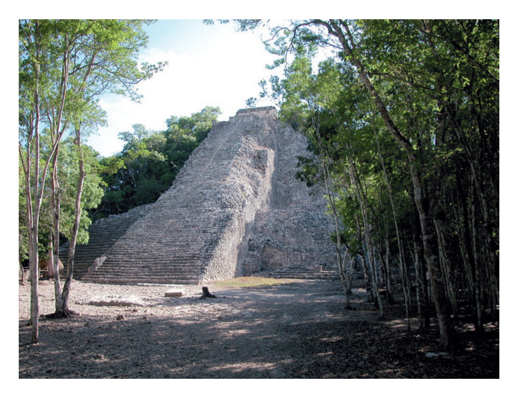
Nohoch Mul Koba

with domestic structures and associated metates document significant processing of maize on the household level and in the central zone. In addition, Koba also has round altars that may have been used as sacrificial stones, with the victim's body recognized as the symbolic center for the sprouting of maize (as illustrated by Maya artists at Piedras Negras, Peten, Guatemala, in the Codex Dresden and Codex Tro-Cortesianus, and in the Temple of the Warriors and Temple of the Jaguars at Chichen Itza).