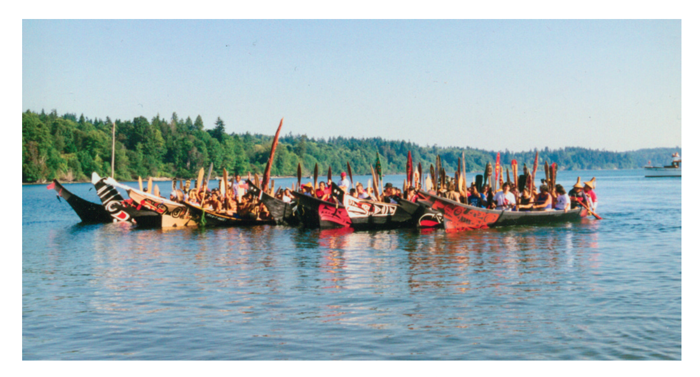
Canoes from Canada and Washington state waiting to be welcomed by the Port Gamble S'kallam Tribe in Washington.

During the generations subjected to "civilization," some of the culture and the Kwak'wala language fell into disuse.