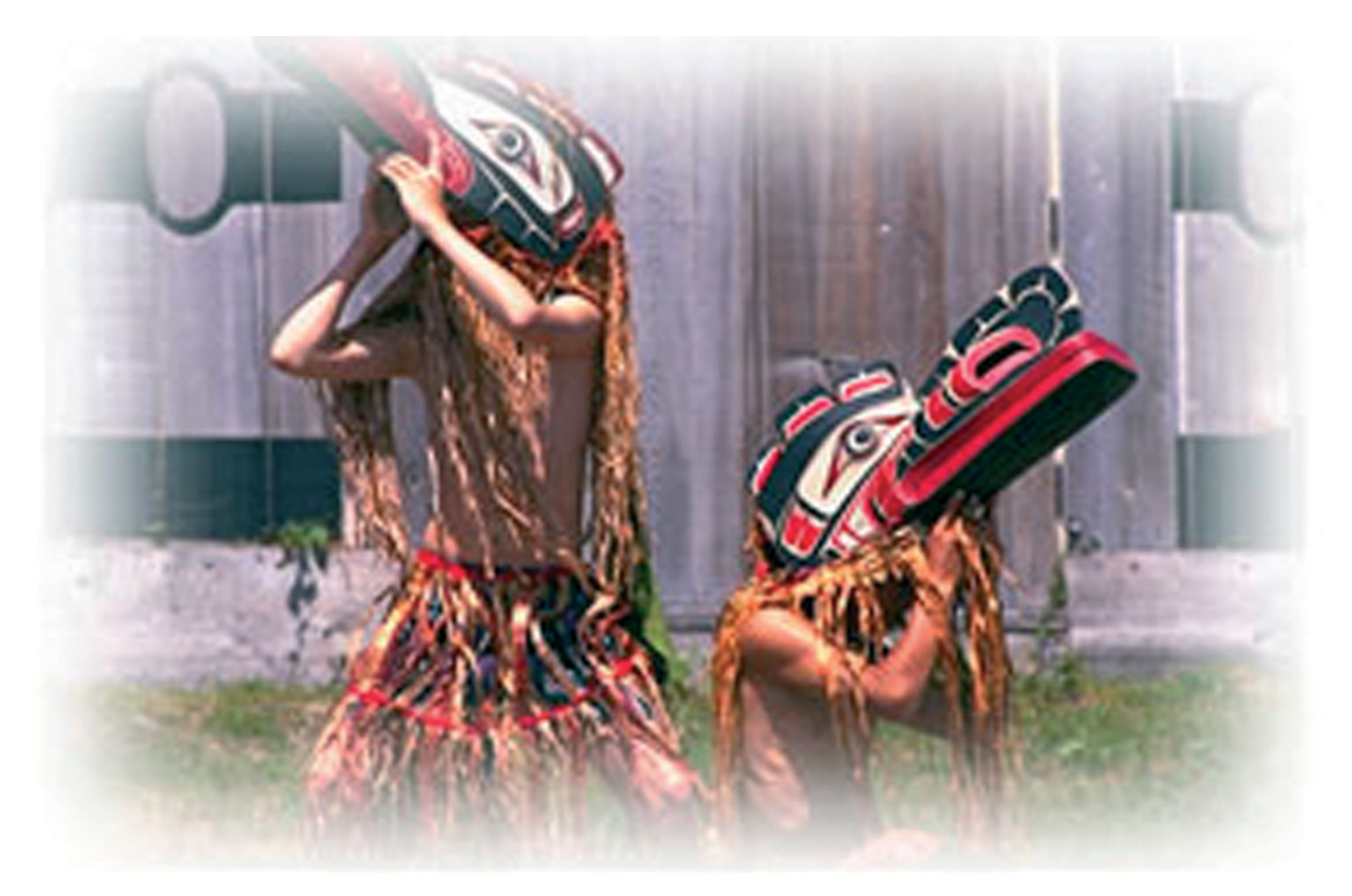
The Kwakw<u>a</u>k<u>a</u>'wakw Hamat'sa or Man-Eater dance

The Kwakiutl are best known for their Winter Ceremonials called T'seka , the potlatches where they competed with wealth, and the Hamat'sa, or Cannibal Dancer initiation rituals. When Europeans arrived in the northwest Americas, mercantilism was promoted and consequently affected every part of tribal lifestyle including clothing, food, transportation, hunting and cooking gear, and the symbols of value within the potlatch. As the ceremonial value or prestige of goods was transformed, the Kwakiutl became infamous for their potlatch wars and related activities. In 1884, the Canadian government enacted a law prohibiting the practice of the potlatch; in 1921, Indian agent William Halliday began arresting potlatch attendants, with sentences to prison for not less than two months. The potlatch artifacts that were confiscated were placed in museums and/or sold. In 1951 the law against the potlatch was removed.