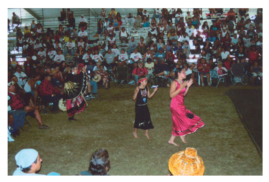
Dancers at the 2003 Tulalip Canoe Quest celebration

Potlatches captured the imagination of newcomers to the Kwakiutl area, and they became highly