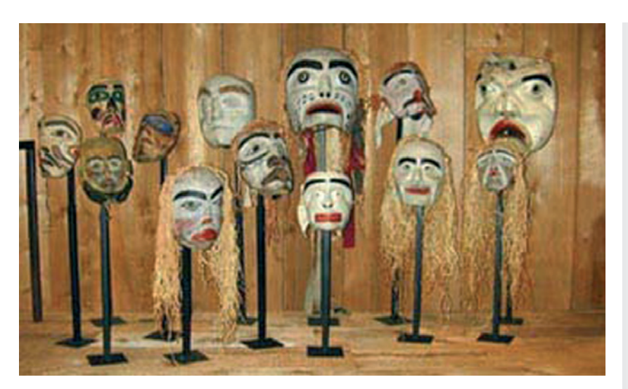
Repatriated masks from the Royal Ontario Museum

origins; supernatural ancestors; and masks. Feasts could be held for weddings, memorials with a memorial pole, welcoming, naming of children, and for winter ceremonies. Formal invitations and strict protocols were observed at festivities, not the least of which involved refusing an invitation until the fourth time it was extended. In a competitive potlatch, canoes might be burned, copper shields broken or "drowned," blankets destroyed, and even slaves killed. In Kwakiutl antiquity there were few potlatches given, for these were costly affairs requiring several years to accumulate enough gifts for payments.