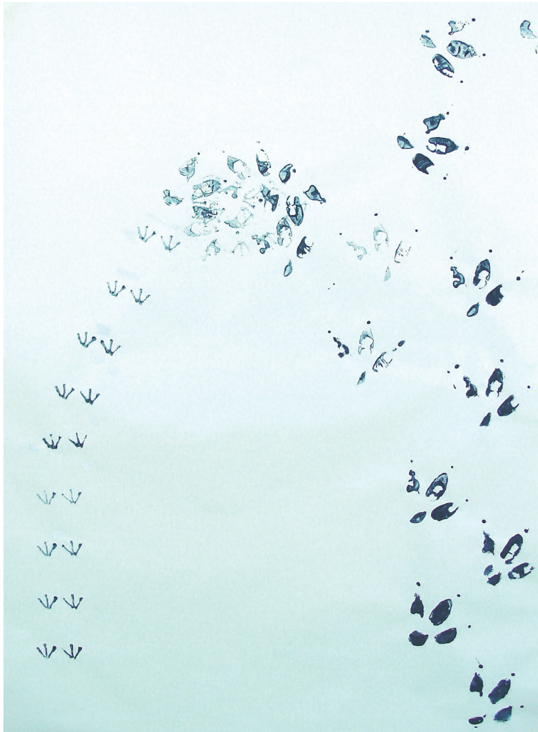
FIGURE 1.2 More evidence is provided; have the ideas changed?

In this case all the ideas had merit, although learners developed their favourite story, but it was not possible to discount the other views. In fact, there was no evidence to suggest that both footprints were made at the same time! Once the learners realised that in this type of science lesson the expectation was for them to promote ideas, to discuss evidence, and that their responses could be modified as more evidence came to light, they were ready and willing to use their enthusiasm and creativity in other activities. Challenging learners to use their ideas and collect evidence can occur in most activities, and as it starts to form their ideas, is more in line with Popper's view of science.