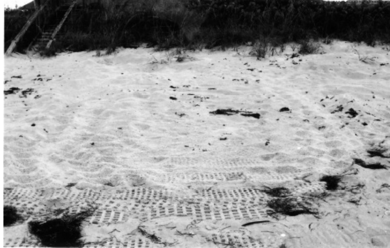
FIGURE 1.3 What made these tracks?

On another occasion, everyday materials were used to link science to real life. Learners were asked to apply this approach to an everyday setting. A range of cans of proprietary soft drinks, i.e. a ‘Coke’, a ‘Diet Coke’ and a ‘7 Up’, and a tank of water were used to challenge learners to provide ideas of what would happen when the cans were placed in water. Learners used previous knowledge of floating and sinking to arrive at suggestions. These included ‘Diet Coke will float as it is lighter’ and ‘They will all sink because they are heavy’. The cans were placed into the water one by one, with an opportunity for the learners to observe what happened to each can, and learners were asked if they would like to alter their ideas based on the new evidence. In the event, the ‘7 Up’ sank, the ‘Coke’ floated just off the bottom and the ‘Diet Coke’ floated just below the surface, which resulted in amazement and quick suggestions as to why this might be. The learners then had to think of ways to test out their ideas.