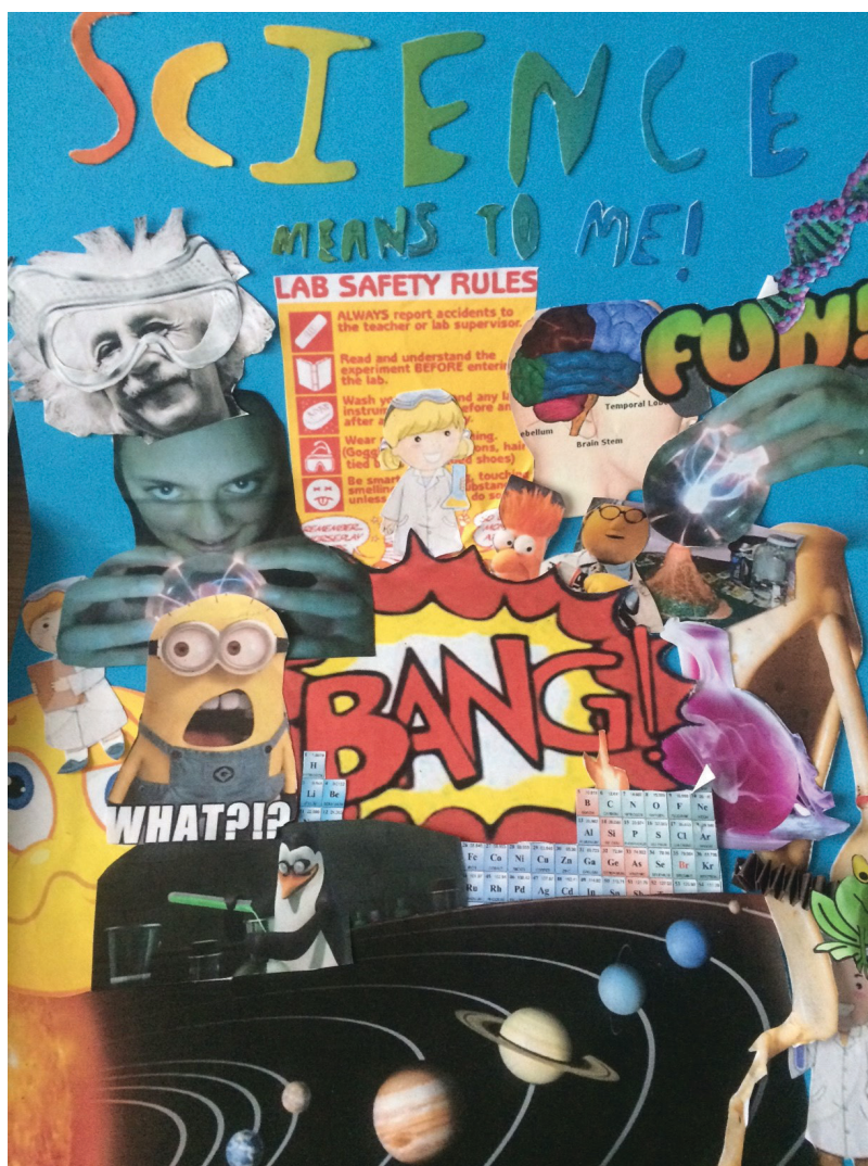
FIGURE 1.5 Collage 'What is science?'

It appears that the learners are far more aware of the world they live in than the drawing a picture of a scientist activity might suggest. They know about positive and negative aspects of science, they show interest in some aspects, like exploring the universe and how science helps with health and wellbeing. Some were able to identify the ‘bad bits’ of science, like making bombs and war. The collages helped the learners to express their knowledge and understanding in a far more sophisticated way than might have been expected.