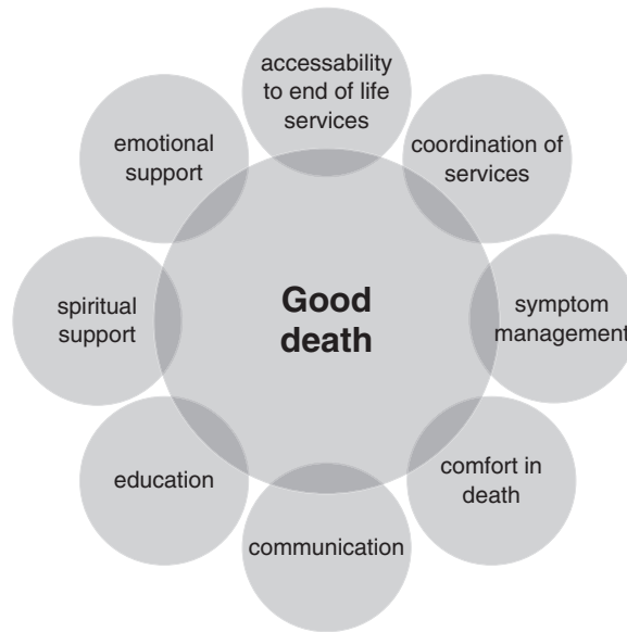
Figure 1.2 Factors influencing a 'good death' (Dy et al. 2007)

These themes were not disease specific but common amongst the numerous conditions. The aims for palliative care within the UK concur with the perceptions from these patients and relatives within the studies examined in the review. High-quality palliative care is not a luxury but should be seen as a significant international public health concern (WHO 2014; Foley 2003). What appears to be the undeniable requirement in achieving these goals for patients and their carers is knowledgeable, compassionate staff. Improving satisfaction is a means of improving the experience of those approaching the end of life (Dy et al. 2007).