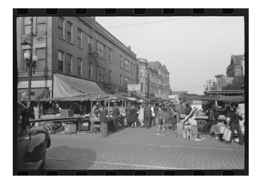
Figure 1.1 Corner of Maxwell and Halsted Streets, Chicago, Illinois, April 1941

... the concept of territorialization plays a synthetic role, since it is in part through the more or less permanent articulations produced by this