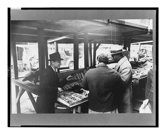
Figure 1.2 Shop on Maxwell Street, Chicago, Illinois, April 1941

Wire-fencing in various size rolls; lighted compasses; a bench drill press; spices in industrial-sized containers; refrigerator/freezers; glazed ceramic tiles in boxes; a telephone-answering machine; long-stemmed glasses and crystal goblets;