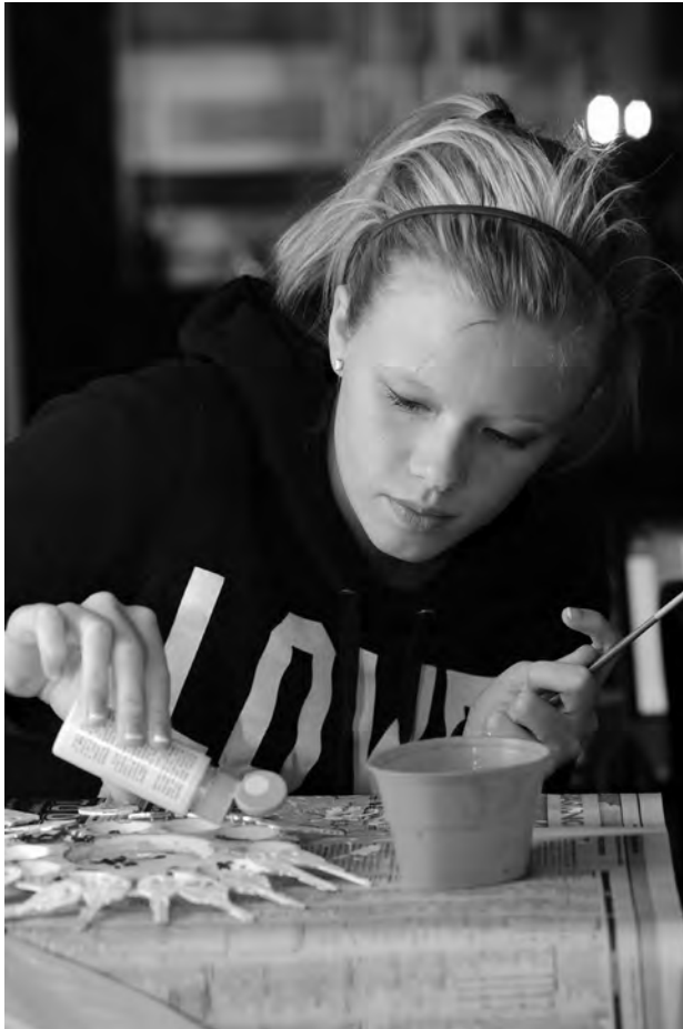
Photo 6.2 Art Is a Nonthreatening Vehicle for Communicating and Expressing Oneself