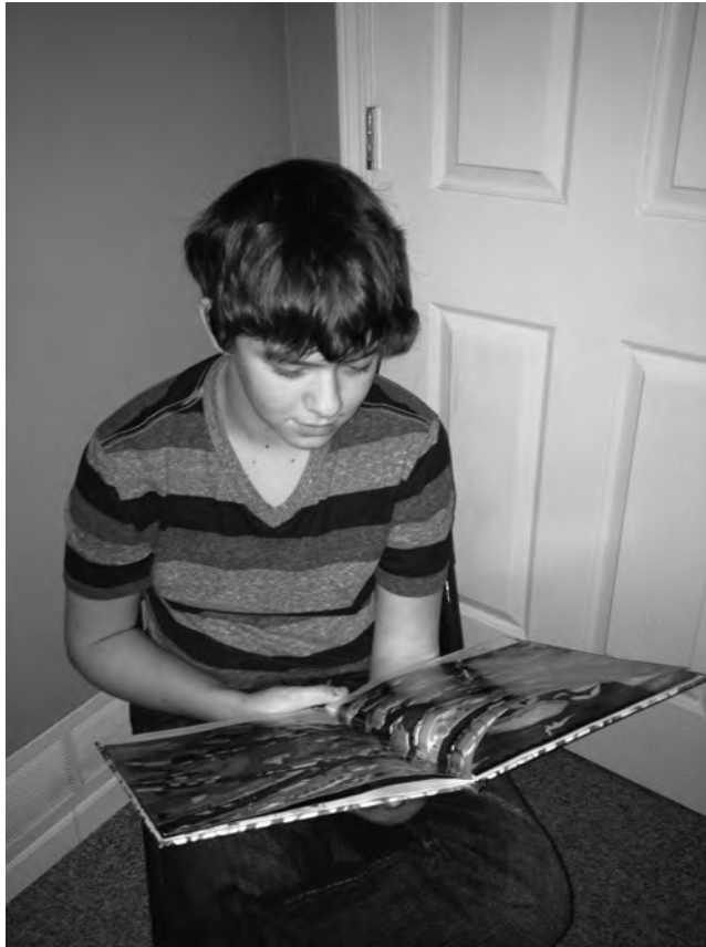
Photo 6.3 The Use of Literature in Counseling Is a Creative Approach for Helping Students Develop Personal Insight While Reinforcing Academic Skills