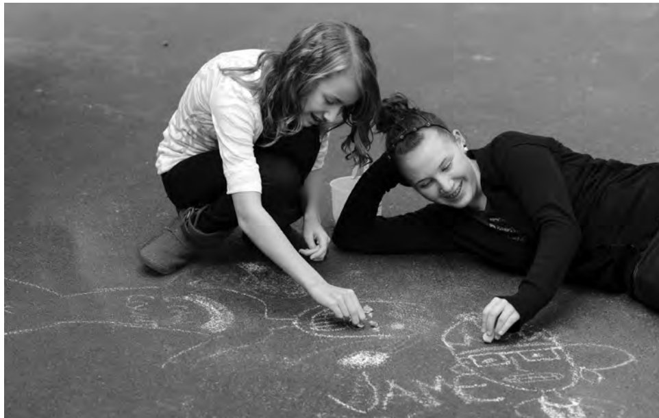
Photo 6.1 Students Expressing Themselves Through Chalk Drawings