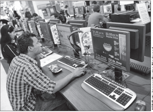
Above, an Internet café in Sydney. Many Australians oppose government plans to build what critics call the Great Aussie Firewall — a mandatory Internet filter that would block at least 1,300 Web sites prohibited by the government.