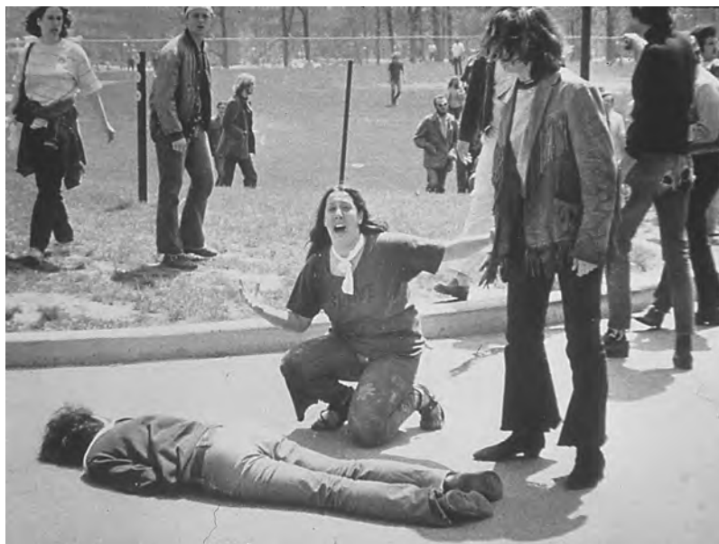
❖ PHOTO 10.2 A young woman screams as she kneels over the body of a student during an antiwar demonstration at Kent State University, Ohio, May 4, 1970. Four students were slain when Ohio National Guard troops fired into a crowd of some 600 antiwar demonstrators.

The New Left adapted its ideological motivations to the political and social context of the 1960s. It championed contemporary revolutionaries and movements, such as the Cuban, Palestinian, and Vietnamese revolutionaries. At its core, "the [American] New Left was a mass movement that led, and fed upon, growing public opposition to U.S. involvement in Vietnam." 3 Many young Americans experimented with alternative lifestyles, drugs, and avant-garde music. They also challenged the values of mainstream American society, questioning its fundamental ideological and cultural assumptions. This component of the New Left was commonly called the counter-culture . The period was marked by numerous experiments in youth-centered culture.