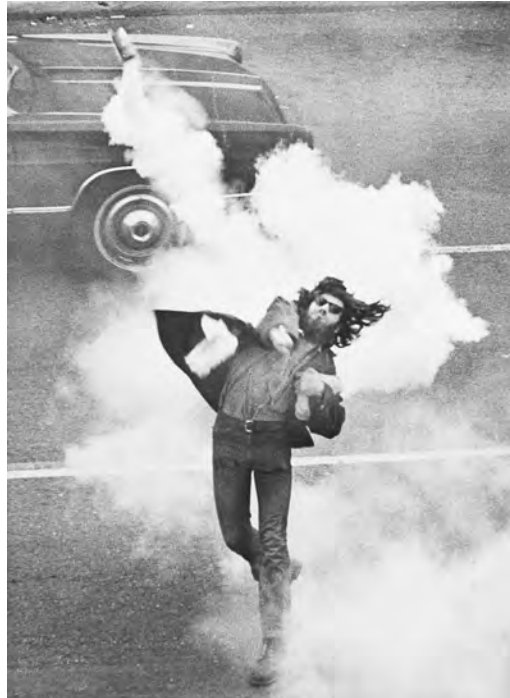
❖ PHOTO 10.1 Anti-Vietnam War Riot. An antiwar demonstrator at the University of California, Berkeley, throws a tear gas canister at police during a student strike to protest the killing of four students at Kent State University in May 1970.

Figure 10.1 shows the number of terrorist incidents in the United States by group class, from 1980 to 2001. Table 10.1 summarizes and contrasts the basic characteristics of contemporary left-wing, right-wing, and international political violence in the United States. 1 This is not an exhaustive profile, but it is instructive for purposes of comparison.