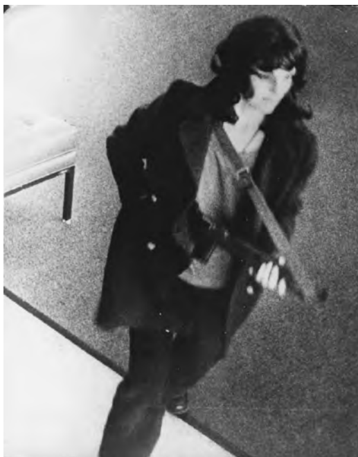
❖ PHOTO 10.3 The Symbionese Liberation Army in action. A bank camera captures Patricia Hearst exiting a bank after an SLA robbery. Hearst, who joined the group after being kidnapped by them, possibly suffered from Stockholm syndrome.

The Symbionese Liberation Army (SLA) was a violent terrorist cell that gained notoriety for several high-profile incidents in the mid-1970s. The core members were