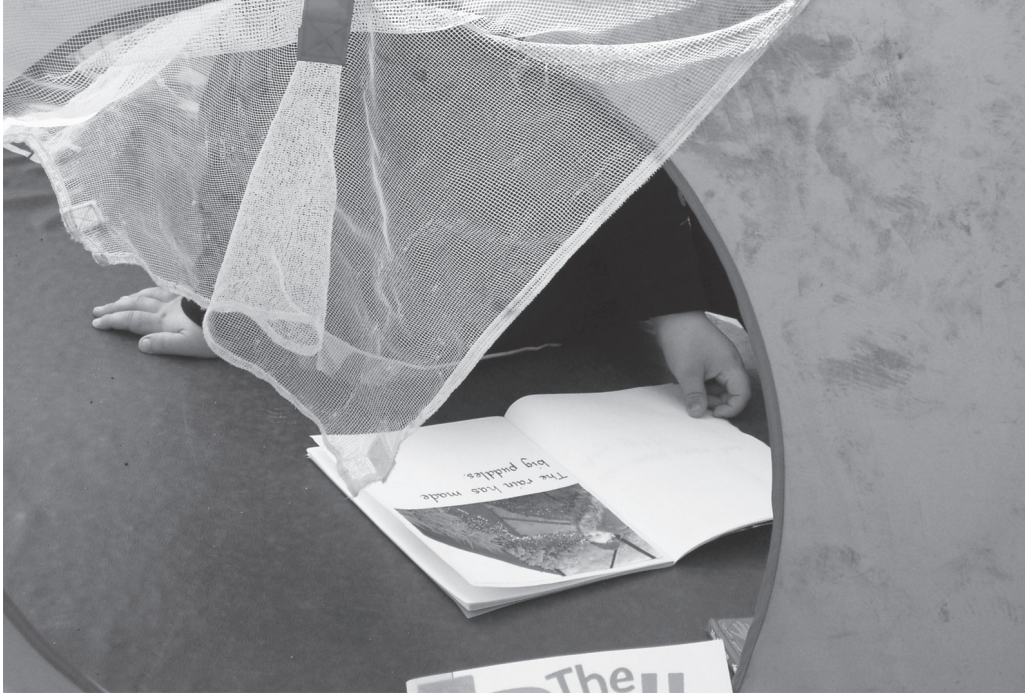
Photo 2.1 A tent for a quiet den

ences. In this chapter I hope to share some of the ideas which as they come together underpin the EL approach.