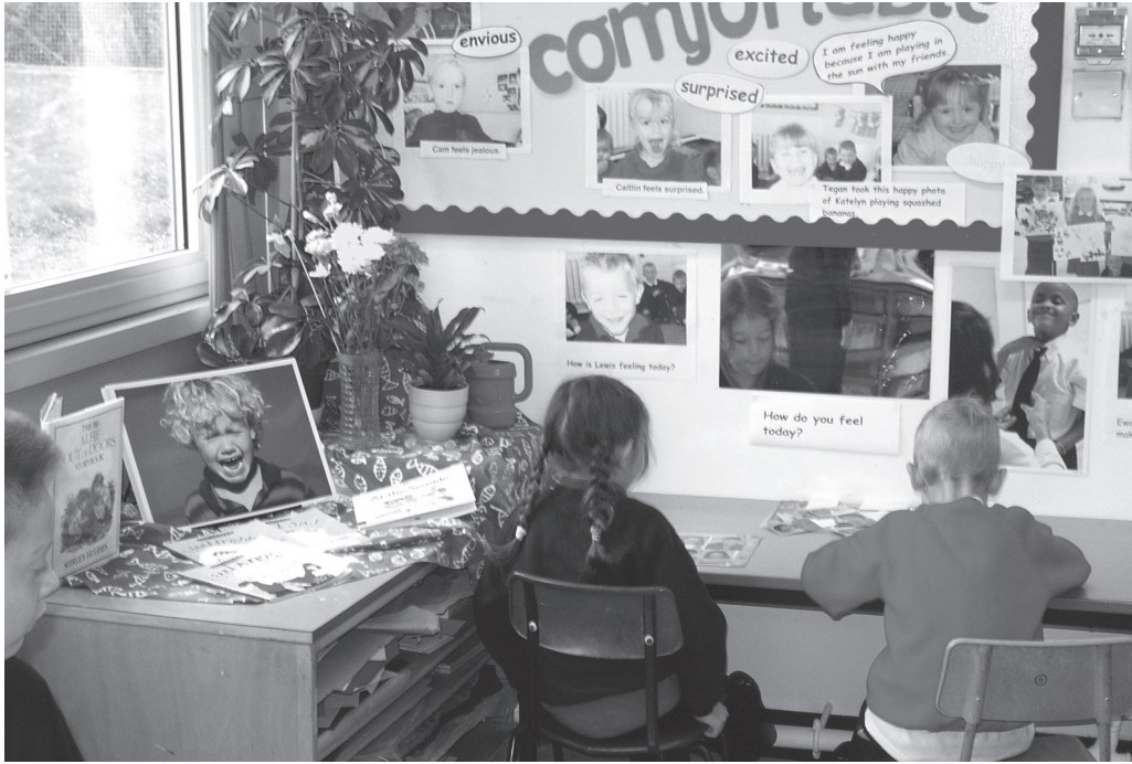
Photo 2.2 A place to sit and think

books, pencils, a class journal, worry box, post-its. This would be a 'thinking space' for reflection on events. A Wall of fame to celebrate success and express feelings of pride might support this area as well as a special person chart which gives each child the opportunity to be a special person for the day. I display their photo with some thoughts why they are special added from the children. The class can decide at the beginning of term what the special day right or rights might be e.g. line leader, responsibility for the class puppet, use of a particular cushion, the right to sit anywhere or in a special chair etc.