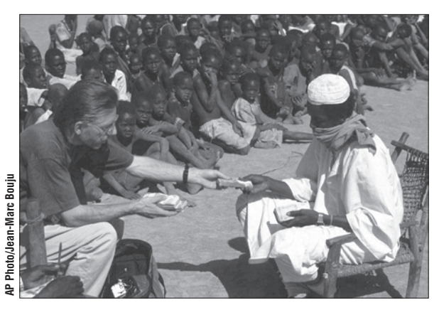
John Eibner of Christian Solidarity International pays an Arab trader to free 132 slaves in Madhol, northern Sudan, in 1997. Critics of slave-redemption say it only encourages more slave-taking, but supporters say that not trying to free slaves would be unconscionable.

Traffickers control their victims through a variety of coercive means. In addition to rape and beatings, they keep their passports, leaving them with few options if they do manage to escape.