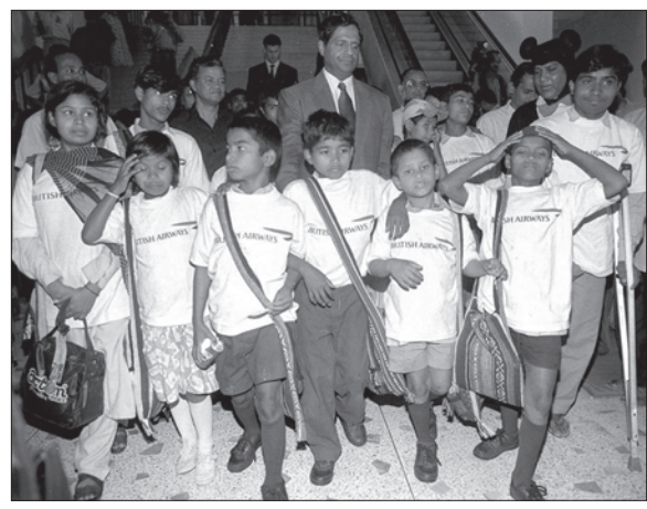
Rescuers return 14 children to their native Bangladesh after they were abducted to India. Children in poor countries sometimes are sold by their parents or kidnapped by traffickers and forced to work without pay, frequently in hazardous conditions.

The law also makes it easier for trafficked victims to acquire refugee status in the United States and allows them to sue their victimizers for damages in civil court.