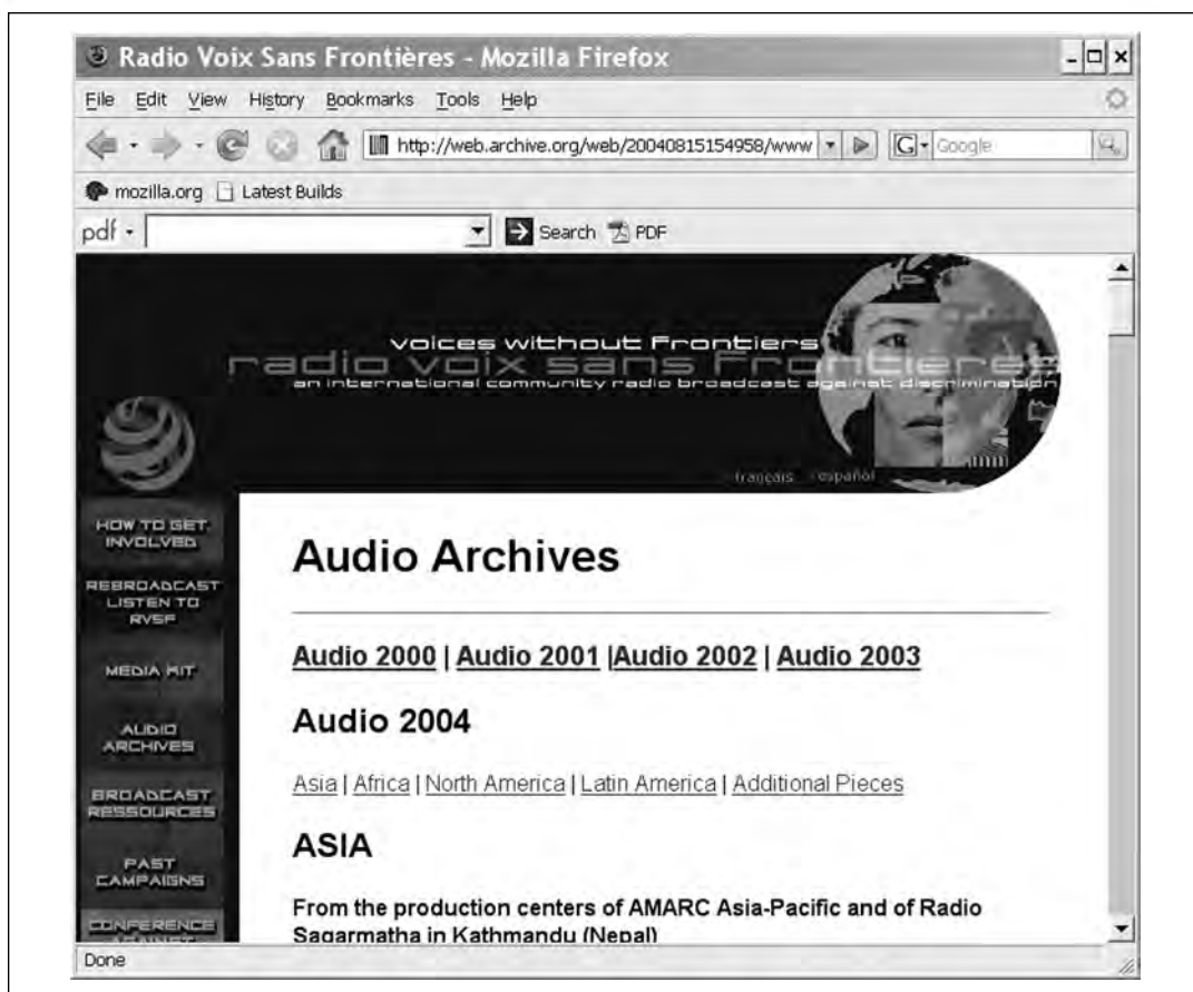
Figure 30.4 Screenshot of 2004 RVSF Archives