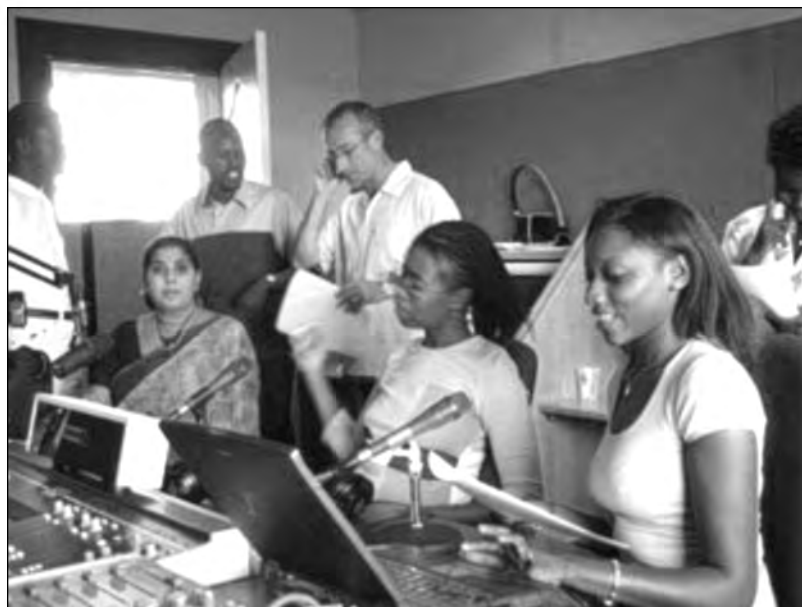
Photo 30.1 RVSF International Broadcast in Johannesburg, South Africa, 2001