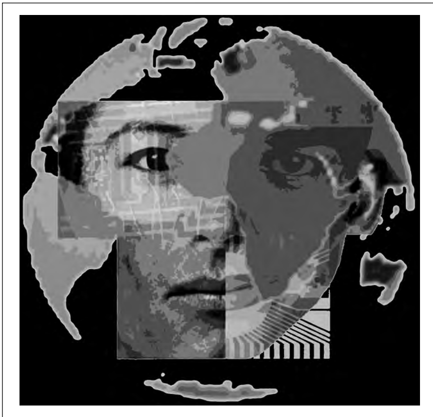
Figure 30.1 RVSF ( Radio Voix Sans Frontières ) Logo