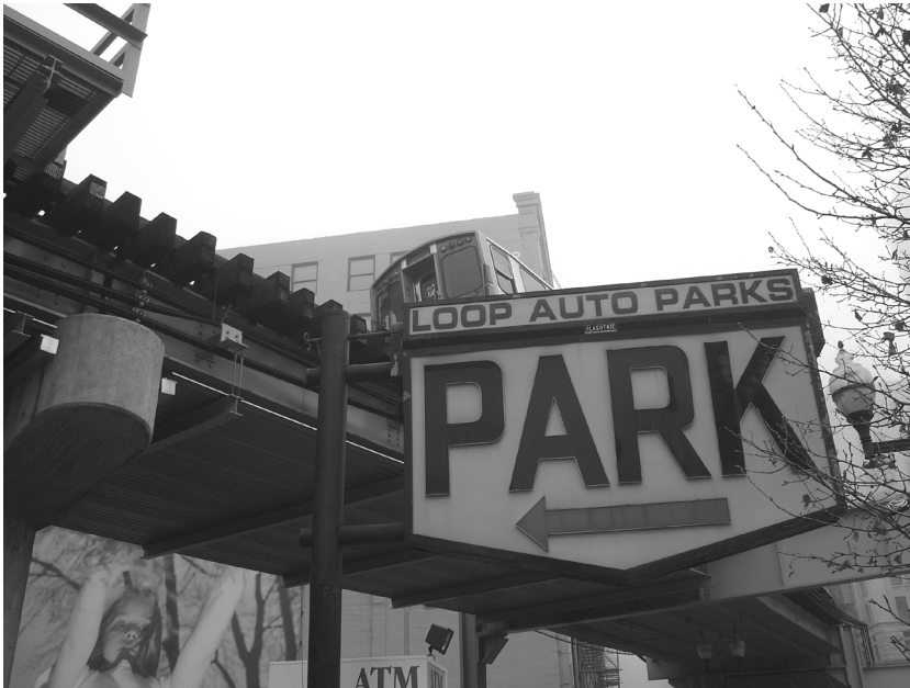
Figure 1.1 'Downtown Chicago has been a laboratory for urban geographers'

being at the centre of transactional density (transport hubs, retail markets, office buildings, theatres, etc.). Groups of landowners began to tussle over building heights, subways and streetcars from the earliest periods of the modern city. Business groups have long been aware of the reduced transaction costs involved in concentrating business activities, most notably the minimisation of travel time when moving between clients. By the late nineteenth century, technological change had hastened the development of skyscrapers in business districts, much to the chagrin of those sections of the middle classes whose views were obscured by the new high-rises, as well as existing landowners whose property values were undermined by the sudden onslaught of new built space.