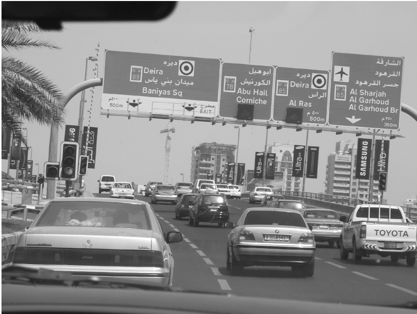
Figure 1.2 'Automobility'