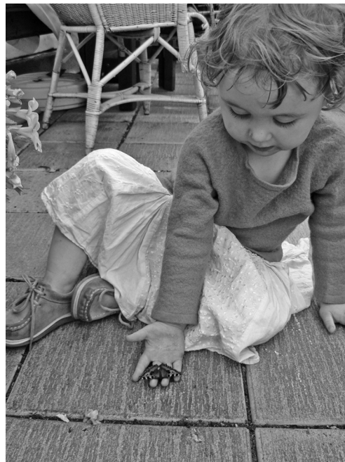
Firsthand encounters foster children's sense of wonder with the natural world

You could read books about it or watch a video, but a sense of wonder and a connection with the planet we live on are better fostered by lying on the grass to look up at the sky, or by climbing to a hilltop, by skimming a stone on the waves or by letting an insect tickle the back of your hand.