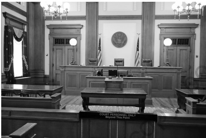
Some forensic psychologists will work and testify in a courtroom setting similar to this one.

Psychologists hold the issue of confidentiality to be of paramount importance. After all, their clients may reveal and discuss deeply personal and difficult issues based on the notion that those discussions will remain confidential. However, especially in forensic settings, there may be