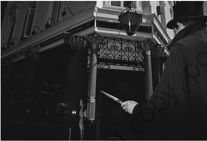
The crimes of Jack the Ripper, whose true identity is still unknown, frightened the people of London and likely led many to wonder what kind of person would commit such atrocities.

In 1888, the people of London England were scared—and with good reason. Women were being murdered, and the murders were especially gruesome. The victims were found with their throats slashed and with some of their internal organs removed. At least five women were killed in such a manner, and perhaps more by the same individual. Naturally, people wondered, who was doing this? What kind of person would do such a thing? And why? Speculation ran wild, with one popular theory being that the murderer was a doctor and their medical training was allowing them to cleanly remove the internal organs, though this still did not answer the questions of who