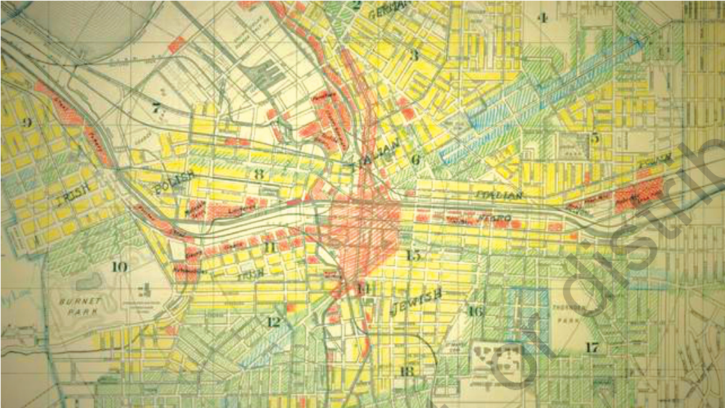
FIGURE I.1 1919 Map of Syracuse (CNY Central)