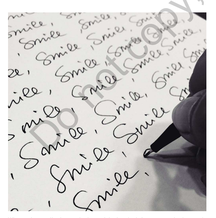
When using qualitative methods, sociologists look for patterns in the words and phrases of respondents in order to find larger themes in their research.

Regardless of the data collection method sociologists use, once they have gathered their data, they must make sense of them. Data analysis can take many forms. For instance, survey data are often analyzed using quantitative methods —this means researchers transform respondents' answers into numbers, enter those numbers into spreadsheets, and then use statistical programs such as Excel, SPSS, or R to help them test their hypotheses. Alternatively, data can also be analyzed using quali -