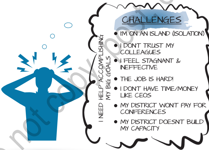
Figure 1.1 Common Leadership Challenges