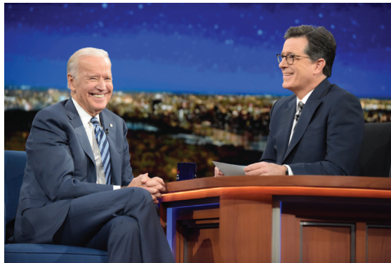
Former Vice President Joe Biden engages in some witty banter with late-night host Stephen Colbert. The line between news and entertainment has continued to blur over the years, making it more difficult for journalists to help readers separate fact from fun.

Over the next five years, the "Florida man" concept grew virally, with everything from a day-by-day calendar that outlined whatever crazy thing a Florida man did on that day to a "Florida Man Night" promotion at a baseball game, in which a law would be broken every inning. 7 The "Florida man challenge" also emerged,