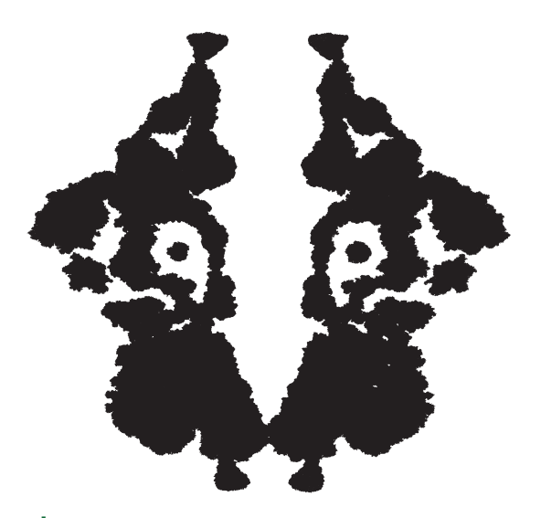
Photo 1.1 Interpretation of inkblots may depend on a person's personality and experiences.

crime prevention and investigation, order maintenance through patrol and other means, and the provision of other miscellaneous services. Although state and federal investigative agencies have an absolutely critical role in law enforcement efforts, in this book, limited attention is paid to the unique and specific issues associated with the operation of these organizations.