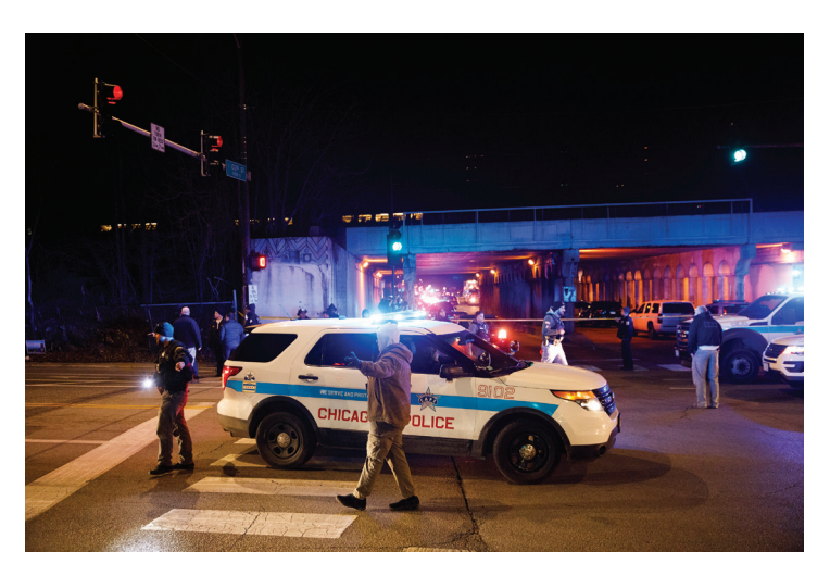
Photo 1.5 Because of the unequal distribution of serious street crime, the police spend more time in some areas than in others.

in many different forms. For example, approximately 50% of crimes are not reported to the police by citizens (victims). It is difficult for the police to address crimes that they are not aware of. Further, in some places and among some people, providing information to the police that may help in a criminal investigation is severely looked down upon as demonstrated by the adage "snitches end up with stiches." Without assistance of citizens, the crimesolving abilities of the police are limited Sometimes, as discussed more directly in Chapter 10, citizens direct violence toward the police. Ideally, citizens are a friend to the police, but in some instances, they are actually a foe. This makes the relationship between the police and the public complicated, to say the least.