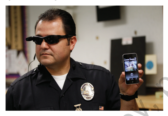
Photo 1.4 Police body-worn cameras have the potential to improve policing, but they have limitations as well.

For agencies that did not use BWCs in 2016, the primary reason was cost: cost of the cameras themselves, as well as cost associated with video storage, maintenance, and public records requests. This is not a minor issue. Most