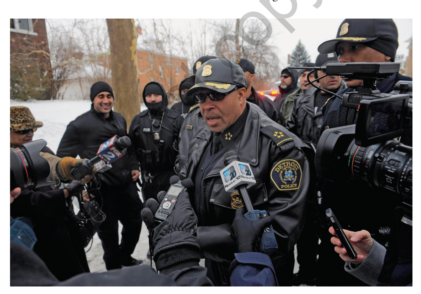
Photo 1.6 The media tend to distort the realities of policing. Some people argue that the intent of the media is more to entertain than to educate.